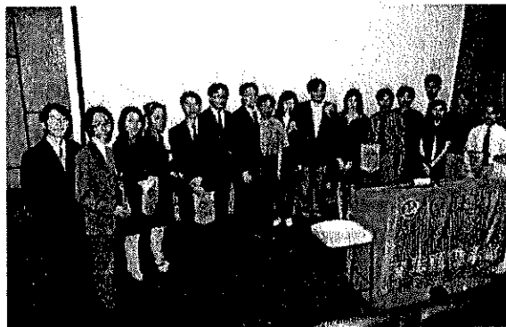
The presenters and organisers gathered for a memorial photo.

Including students, guests and members, nearly 120 people attended the function.