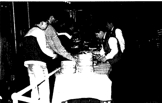
• Waiting for and selecting delicious food.