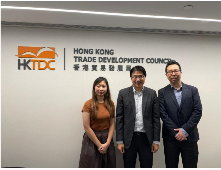
Representatives from HSUHK and CILTHK share ESG Survey Interim Findings at Hong Kong Trade Development Council.